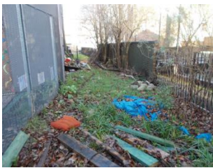
The nature area picture before (above) was nurtured, and now looks beautiful (right)